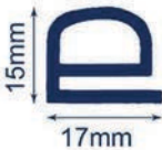
RE1639 EPDM Rubber Black 'e' seal UV Stable 15mm x 17mm