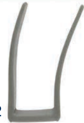
RE1332 EPDM Rubber Gray TWO finger seal 32mm legs 10mm center channel