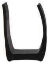
RE1328 Neoprene Rubber Black TWO finger seal 28mm legs 12mm center channel