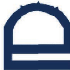
RE771 EPDM Rubber Black 'e' seal UV Stable 35mm x 35mm