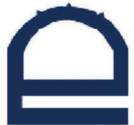
RE771WH EPDM Rubber White 'e' seal UV Stable 35mm x 35mm