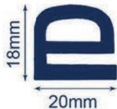
RE1839 EPDM Rubber Black 'e' seal UV Stable 18mm x 20mm