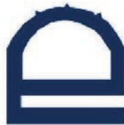
RE636 EPDM Rubber Black 'e' seal UV Stable 25mm x 25mm