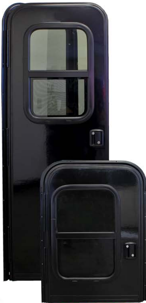
Left Hand Hinge shown