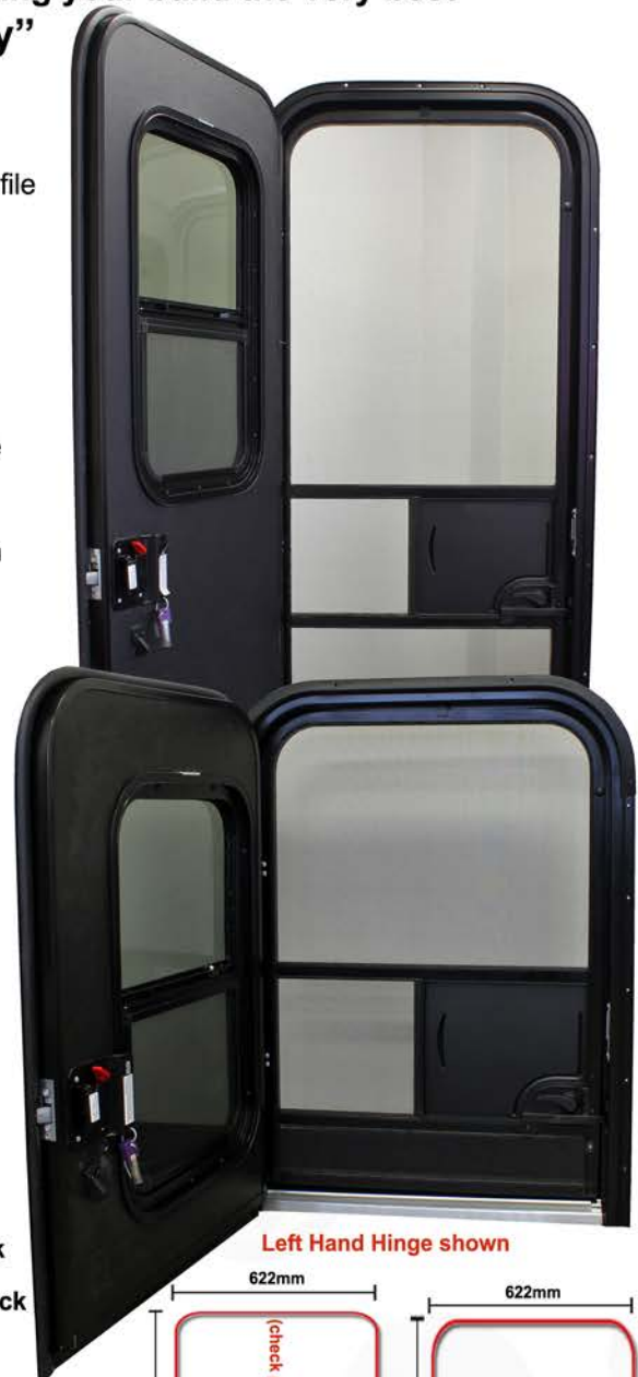
Left Hand Hinge shown

Standard sizes & cut-out guide : Door are sized by cut-out dimension