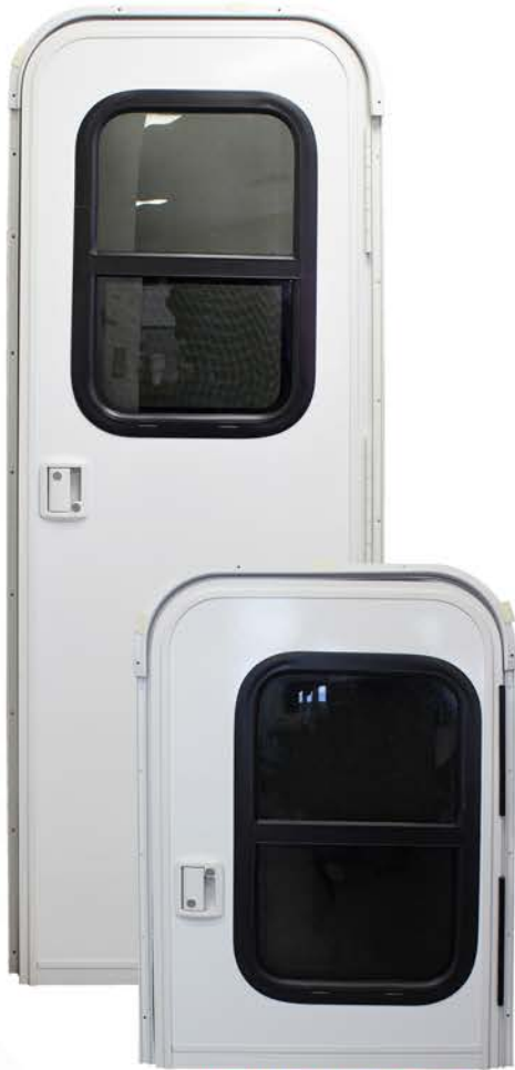
Right Hand Hinge shown

Heavy Duty formed aluminum frame with fiberglass paneling, anti-theft locking access handle, Full size fly screen door, both doors opening with 180° leaf-hinges, Vertical sliding window Dark-Tint Glass with sliding fly screen, providing your build the very best “Build with quality”