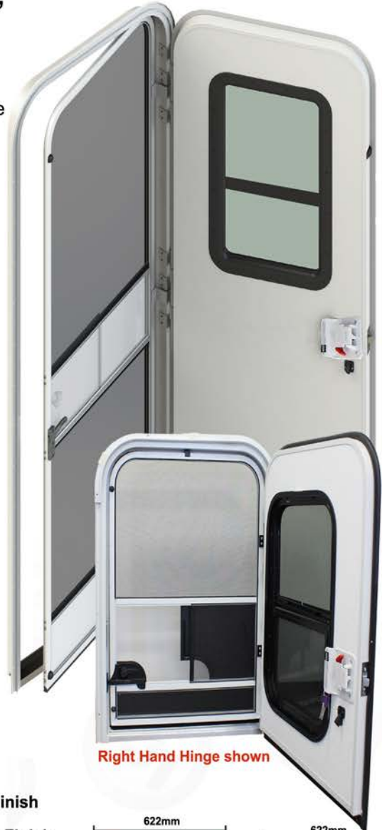
Right Hand Hinge shown