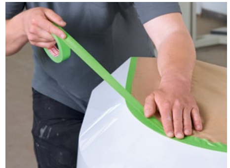
Secure fixation of masks